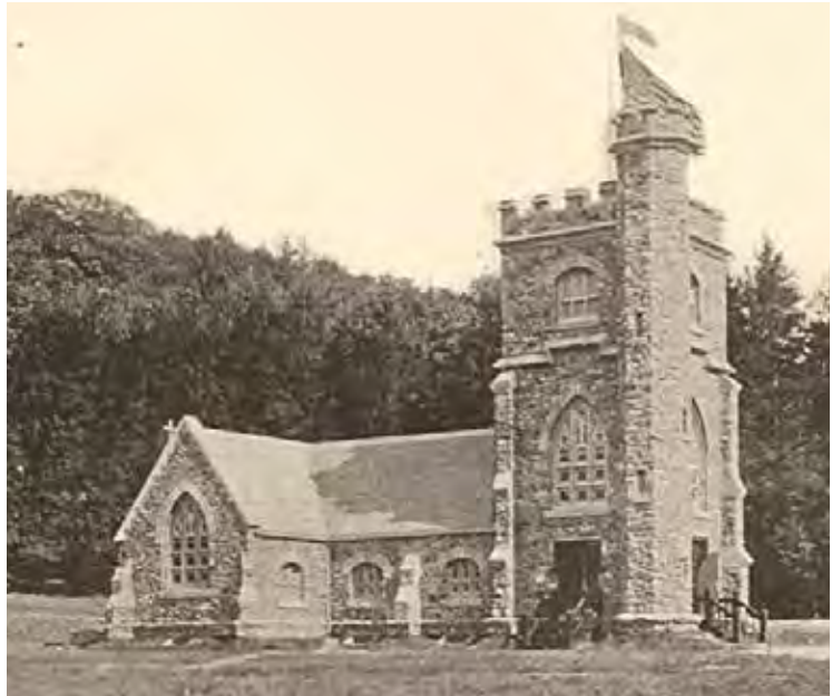
The church and Greeley Grove behind it are both listed on the National Register of Historic Places; below, current views of the church and rectory.