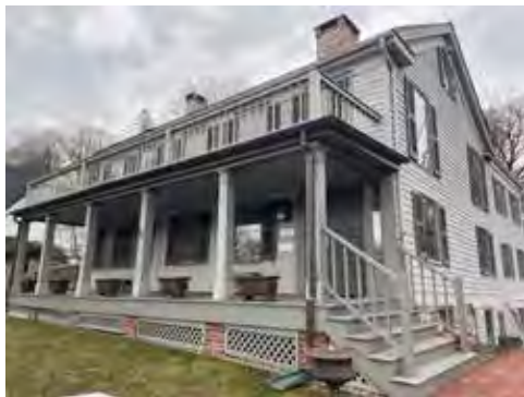
A signpost marking Chappaqua's Quaker history; Horace Greeley House (now a museum); and below, views of town and the train station.