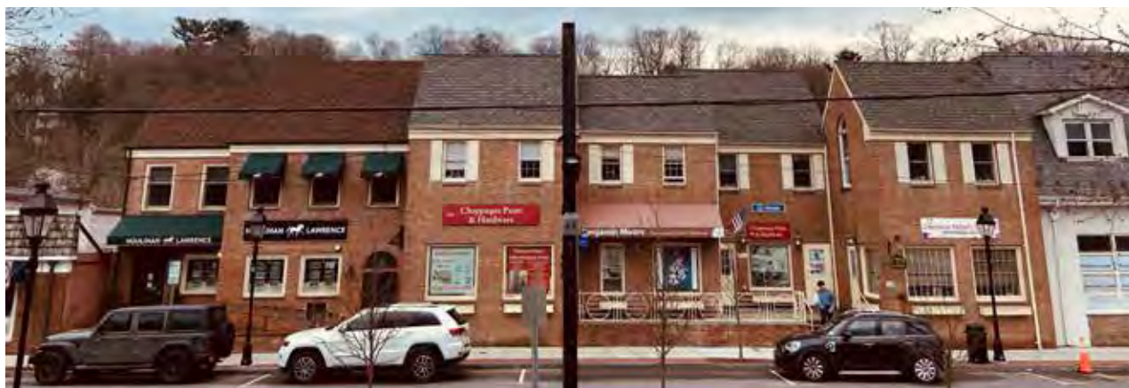
Shops along South Greeley Avenue.